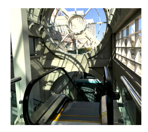
The upper end of escalator number one, completed.

"This is a very busy convention center," Bob adds. "To take any of our vertical people movers out of service is tough for us. KONE worked with our schedule in a very tight timeframe, and they completed the job on time. We really appreciate their efforts to partner with us on this project."