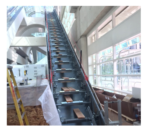
Installation of incline modules is underway on one of the 40-foot units.