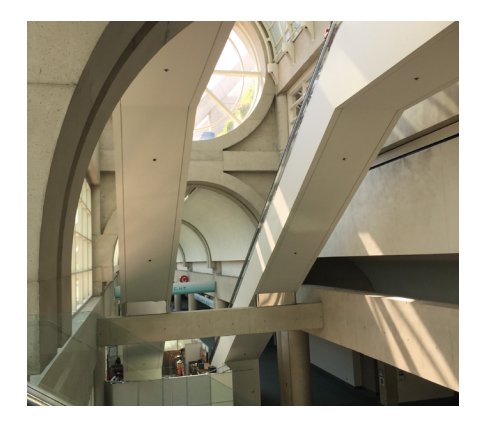
The KONE EcoMod™ solution requires a smaller barricade, minimizing disruption to normal operations.