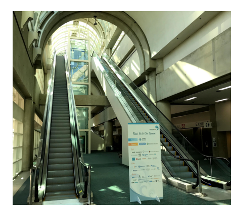
Completion of KONE EcoMod ^{\text{TM}} installation on two of the 40-foot units.